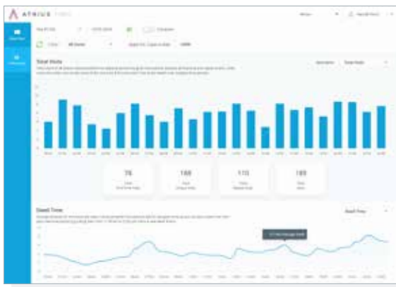
Single Site Metrics

Gain understanding of how visitors interact with your space to optimize customer journeys, analyze and predict traffic and behavioral patterns, and improve conversions.